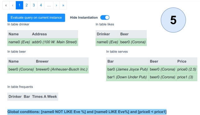
Figure 6: Instantiation screen.

c-instance I of R is a tuple of the form (\{T_1, \dots, T_r\}, \phi) , where for each i \in [1, r] , T_i is a c-table with schema R_i , and the global condition \phi is a conjunction of atomic conditions associated with the c-instance. The atomic conditions in the c-instance are either (1) an atom of the form [x \text{ op } c] ( \neg[x \text{ op } c] ) or [x \text{ op } y] ( \neg[x \text{ op } y] ) where x and y are labeled nulls, c is a constant in the active domain, and \text{op} is a binary operator, or (2) a condition of the form \neg R(x_1, \dots, x_k) where R is a relation on k attributes.